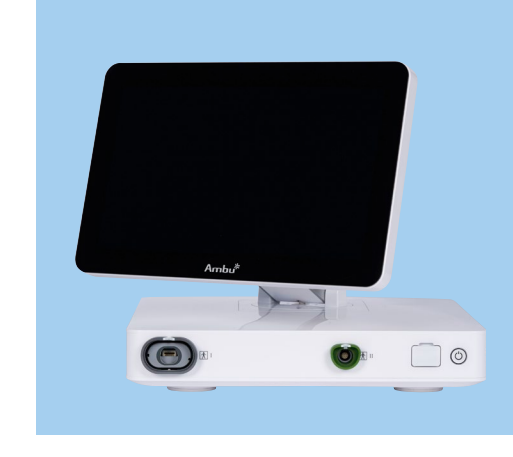
The compatible Ambu aBox 2 display and processing unit