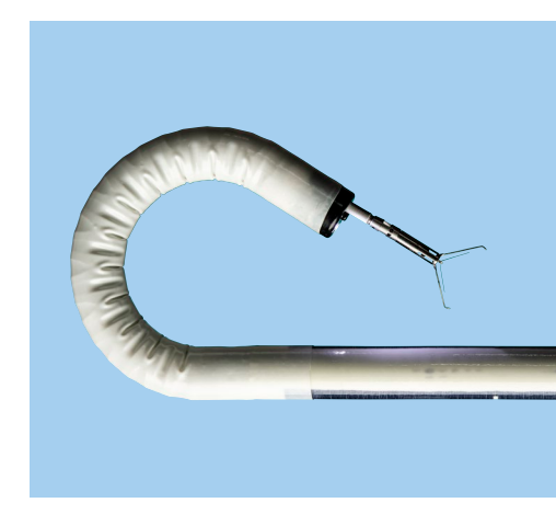
210° retroflexion of the aScope Gastro